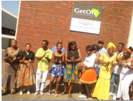
Heritage Day Event 2017