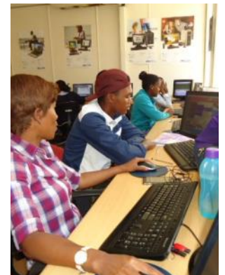
Students in class

“One of the most important tasks for aspiring entrepreneurs is to invest in their own education.”