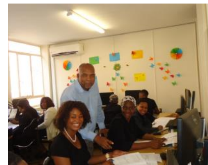
Point of Sales Class