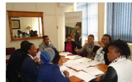
Students in interviews