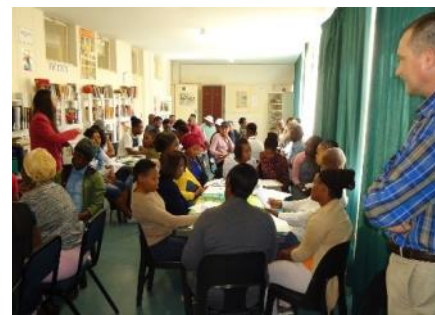
UNISA Literacy Session

Future initiatives may see drama being used more often as roleplay encourages students to act out or practice real life situations and to speak professionally. These skills are invaluable during job interviews and in the work environment.