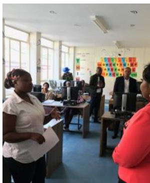
BNZ Tour of GetOn

GetOn would like to thank ArcelorMittal for their support and donation of R250 000 for the 2018 financial year. It has been a great honor to work with the ArcelorMittal team over the past five years.