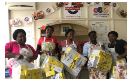
Premier Donation to students