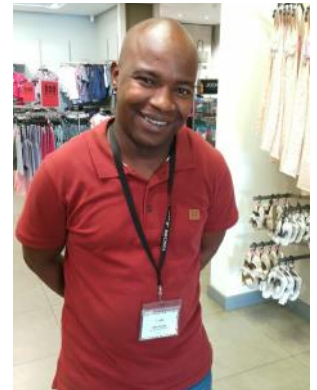
Student Happily Employed

“The replication of GetOn Skills Development Centre is long overdue”