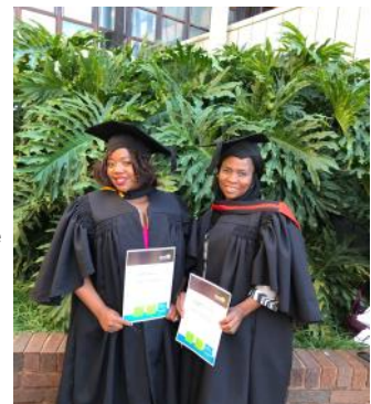
Graduates May 2018