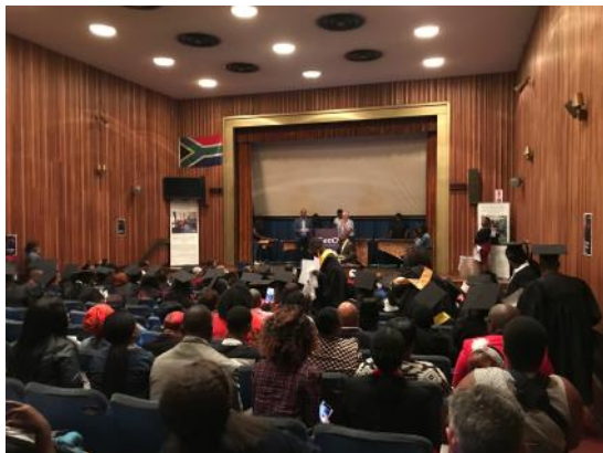
GetOn Skills Development Graduation May 2018

“I’m thankful for the opportunity to have studied the Point of Sales course at GetOn Skills Development Centre. In a world where so many young people are struggling to meet their basic needs, I am fortunate to say that I have a salary, to fulfill my personal needs and those of my family. I have been working for Smollan as a merchandiser for over 2 years now and I love what I do. I am excited for the possibilities that await me each day that will make me thrive in what I do. Everywhere I go I recommend GetOn to all my friends that are also trying to better their lives.”