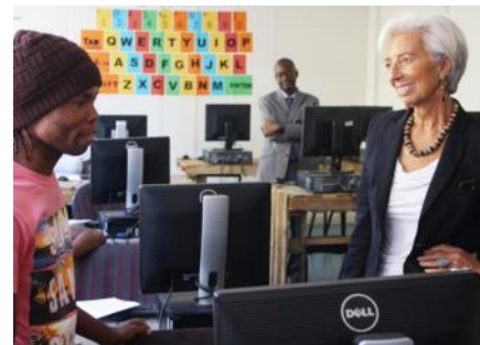
Christine Lagarde, MD of the IMF

"Inspired and grateful for the work organizations like GetOn Skills Development Centre in Pretoria are doing to help fight youth unemployment - preparing and empowering young people to find jobs or start their own businesses" – Christine Lagarde.