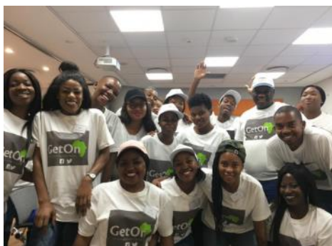
GetOn students at Visa Head Office