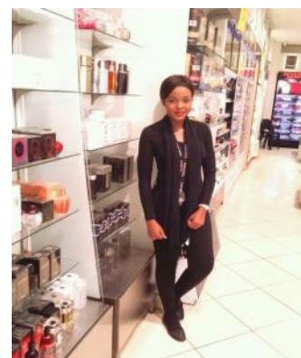
A happily employed student

“Young people are languishing at home, unemployed, hopeless and discouraged and organizations like GetOn can make a meaningful difference in remedying the situation. ”